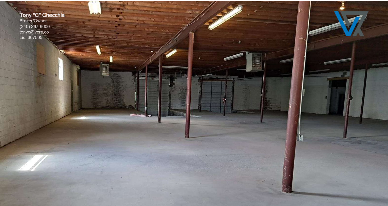
Storage Only | 917D North East Street, Frederick, MD, 21701