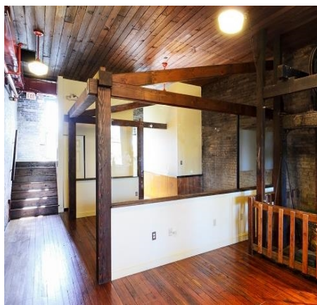
HISTORIC DOWNTOWN FREDERICK BUSINESS AND RETAIL DISTRICT

16 E Patrick St, 3rd Floor Frederick, MD 21701